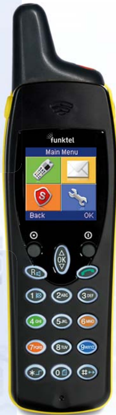
funktel FC4 S Ex HS

The new Ex-HS models of the funktel FC4 series enable safe use in industrial environments with explosive dusts and gases thanks to specially designed and sealed housings and electronic protective measures—certified according to the strictest specifications and at high volume even with headphones or headsets. → pages 7 and 9