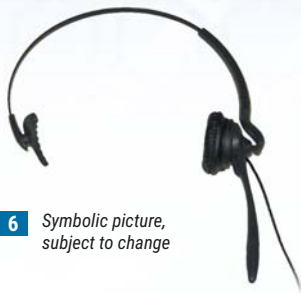
6 Symbolic picture, subject to change

User ..... 5.010.885.000 S-Admin ..... 5.010.888.000